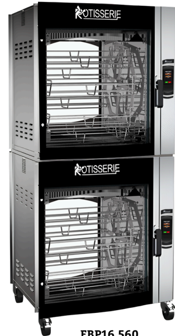
FBP16.560 Stackable & Passthrough

Our stackable Roti Roaster units FBP16.760 and FBP16.560 are designed for versatility and convenience in high-demand kitchens. These models provide a compact and efficient way to cook multiple items simultaneously, increasing your throughput while saving valuable space.