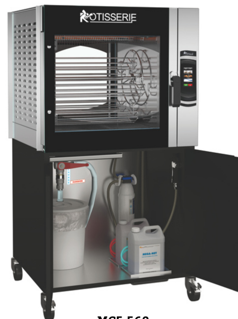
MC5.560 Pass Through