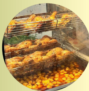
Potatoes cooked and seasoned in the integrated cooking drip pan