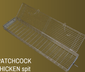
SPATCHCOCK CHICKEN spit