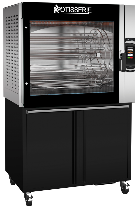
SC8.760 + SC8.760MSTO (optional base cabinet)