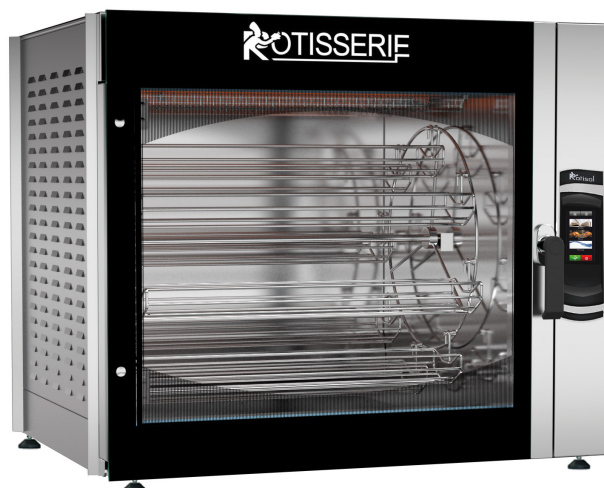
SC8.760 + SC.PIED