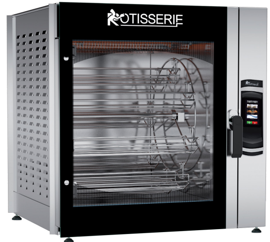
SC8.560 + SC.PIED