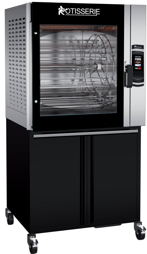
SC8.560 + SC8.560MSTO (optional base cabinet)