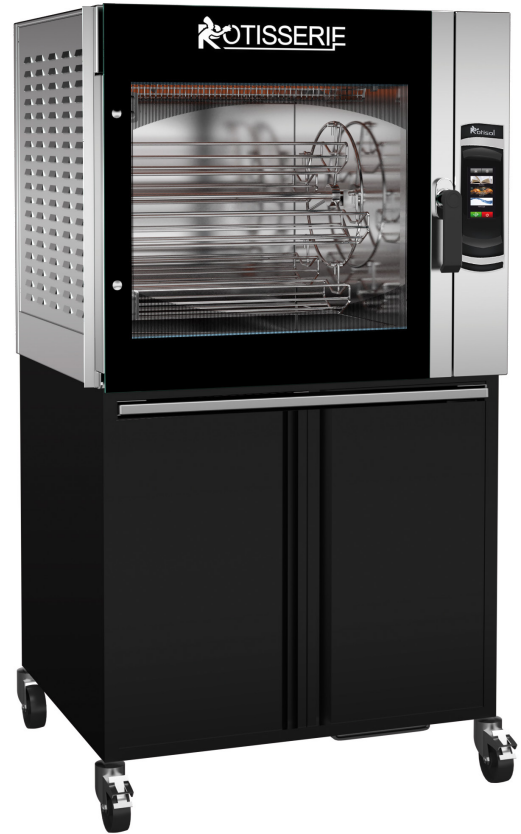
SC5.560 + SC5.560MSTO (optional base cabinet)

Multiple Preset and manual recipes (+ can add up to 99 programs)