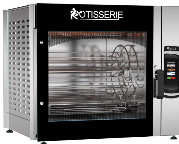
SC5.560 + SC.PIED