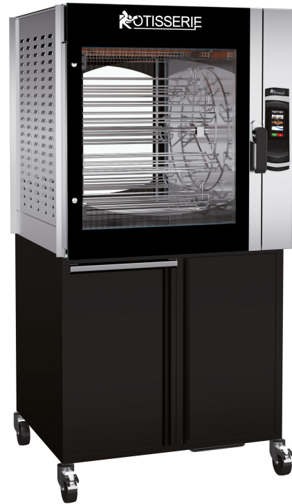
MCT8.560 + MC8.560MSTO