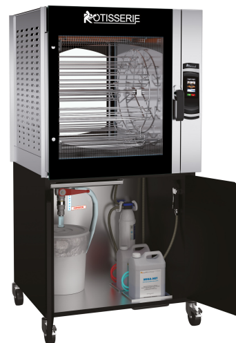
MCT8.560 + MC8.560MSTO (open cabinet)