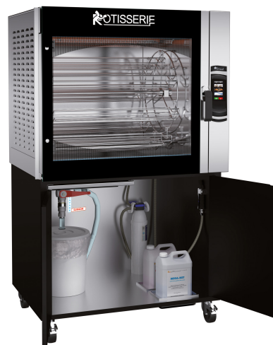
MC8.760 + MC8.760MSTO (open cabinet)