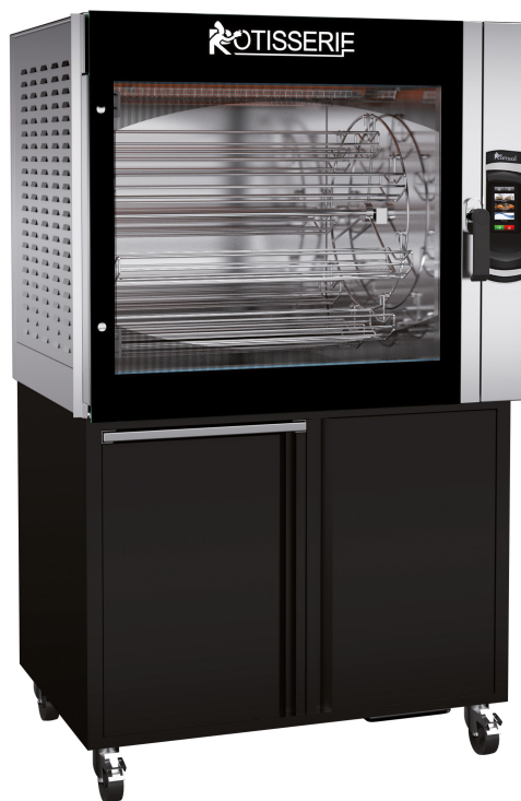
MC8.760 + MC8.760MSTO

Steam/Automatic cleaning program + Detergent and descaler management