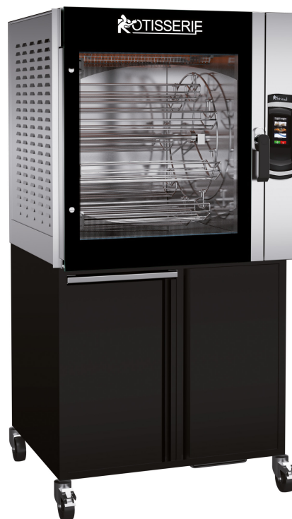
MC8.560 + MC8.560MSTO

Steam/Automatic cleaning program + Detergent and descaler management