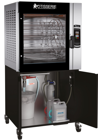
MC8.560 + MC8.560MSTO (open cabinet)