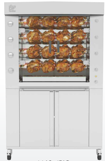
1160.4PiG Stainless steel