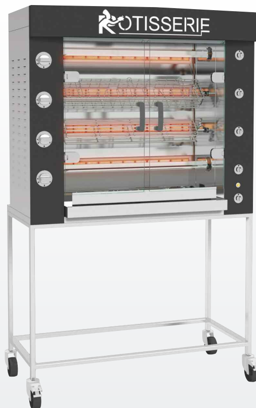
1160.4PG Black enamel