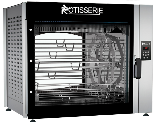
FBPT8.760 + FBP.PIED