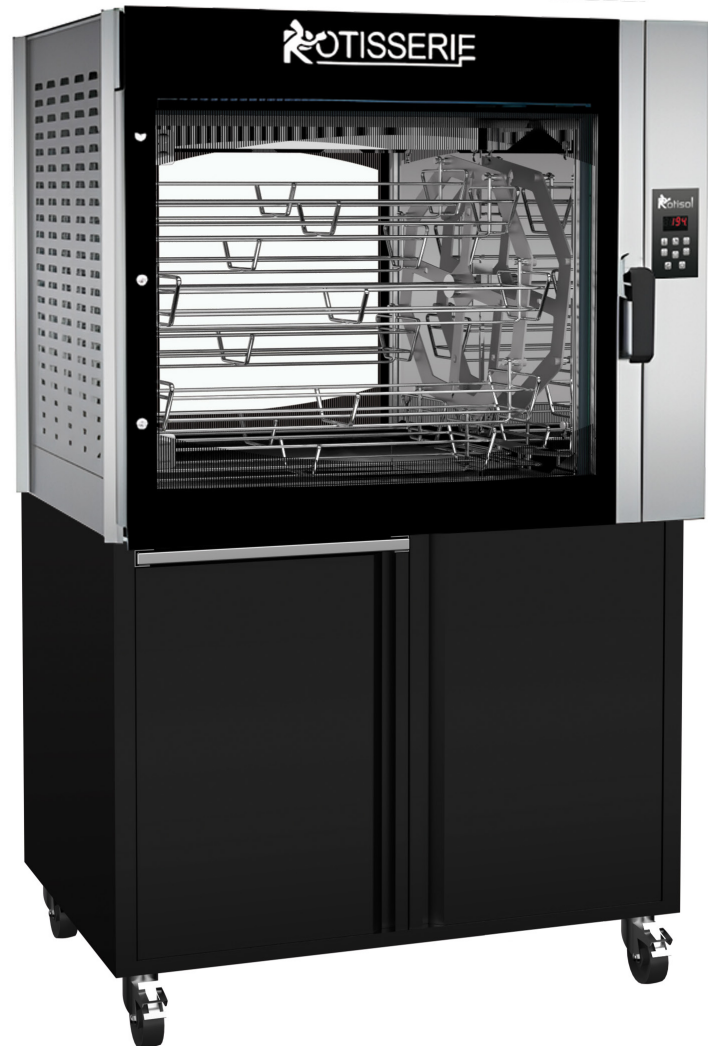
FBPT8.760 + FBP8.760MSTO (optional base cabinet)

Additionally, K-GLASS minimizes heat emission in the kitchen, creating a cooler and more comfortable workspace for your team. The enhanced insulation also improves safety by preventing burns upon contact with the door surfaces, ensuring a secure cooking environment.