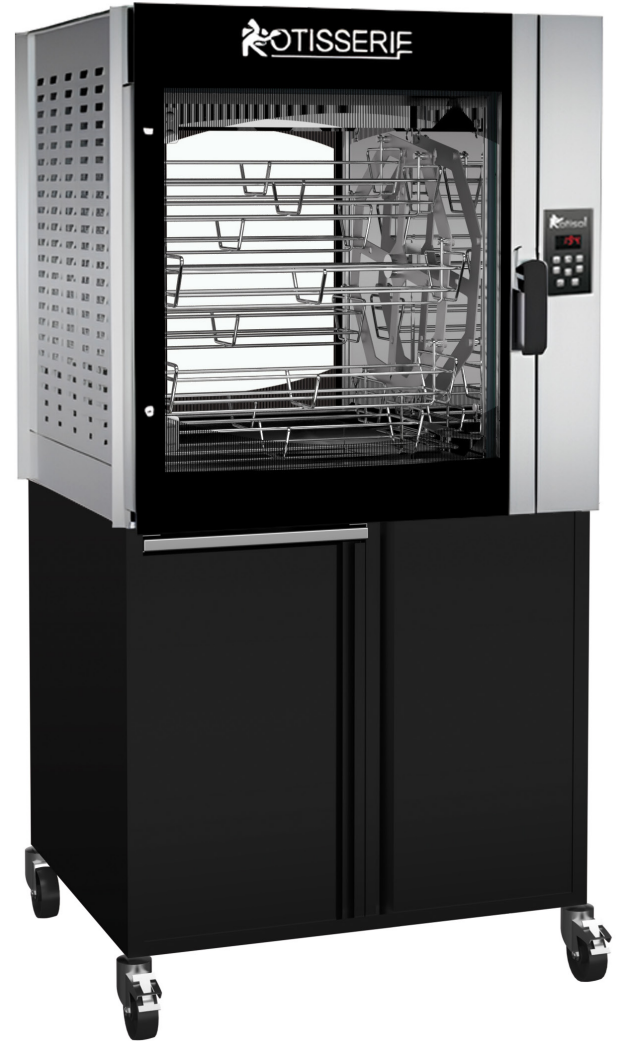
FBPT8.560 + FBP8.560MSTO (optional base cabinet)

Additionally, K-GLASS minimizes heat emission in the kitchen, creating a cooler and more comfortable workspace for your team. The enhanced insulation also improves safety by preventing burns upon contact with the door surfaces, ensuring a secure cooking environment.