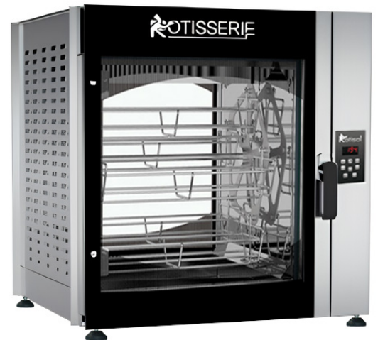
FBPT8.560 + FBP.PIED