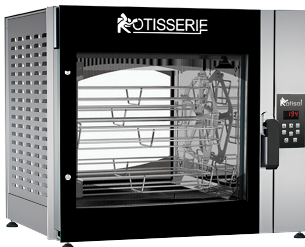
FBPT5.560 + FBP.PIED