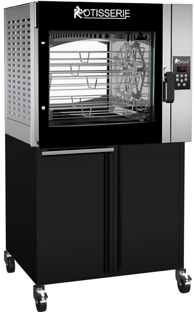
FBPT5.560 + FBP5.560MSTO (optional base cabinet)

Additionally, K-GLASS minimizes heat emission in the kitchen, creating a cooler and more comfortable workspace for your team. The enhanced insulation also improves safety by preventing burns upon contact with the door surfaces, ensuring a secure cooking environment.