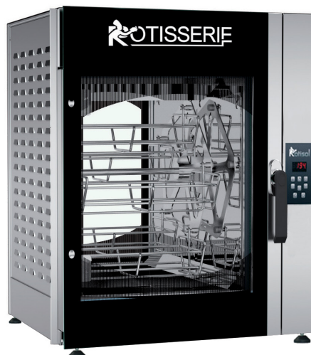
FBPT5.360 + FBP.PIED