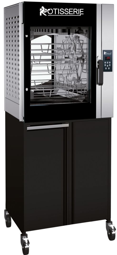
FBPT5.360 + FBP5.360MSTO (optional base cabinet)

Additionally, K-GLASS minimizes heat emission in the kitchen, creating a cooler and more comfortable workspace for your team. The enhanced insulation also improves safety by preventing burns upon contact with the door surfaces, ensuring a secure cooking environment.