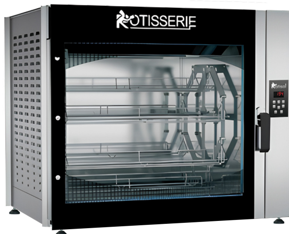
FBP8.760 + FBP.PIED