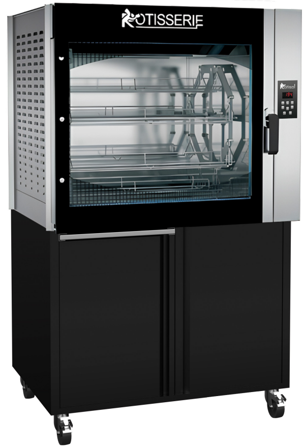
FBP8.760 + FBP8.760MSTO (optional base cabinet)

Additionally, K-GLASS minimizes heat emission in the kitchen, creating a cooler and more comfortable workspace for your team. The enhanced insulation also improves safety by preventing burns upon contact with the door surfaces, ensuring a secure cooking environment.