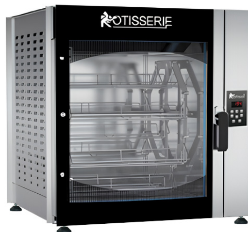
FBP8.560 + FBP.PIED