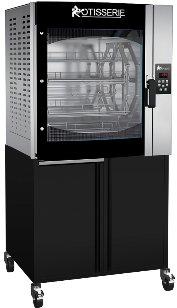
FBP8.560 + FBP8.560MSTO (optional base cabinet)

Additionally, K-GLASS minimizes heat emission in the kitchen, creating a cooler and more comfortable workspace for your team. The enhanced insulation also improves safety by preventing burns upon contact with the door surfaces, ensuring a secure cooking environment.